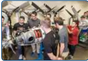
Engine and Propeller Lab