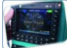
Radio Navigation Lab