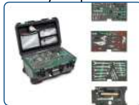
Tool kit and Tool Crib